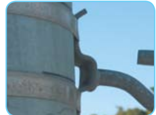
Pole testing rig (banded hook)

Vertical loads were placed on the banded Pigtail hook fitted to the SURELINE® steel pole. Loading commenced at 100kg and increased at 50kg increments up to 300kg.