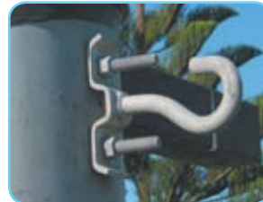
Pole testing rig (bolted hook)