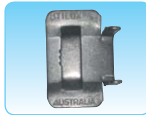
Non re-usable clamp

In 2006 BlueScope Steel undertook load testing of a commonly available pole band to understand the performance of bands on straight sided poles.